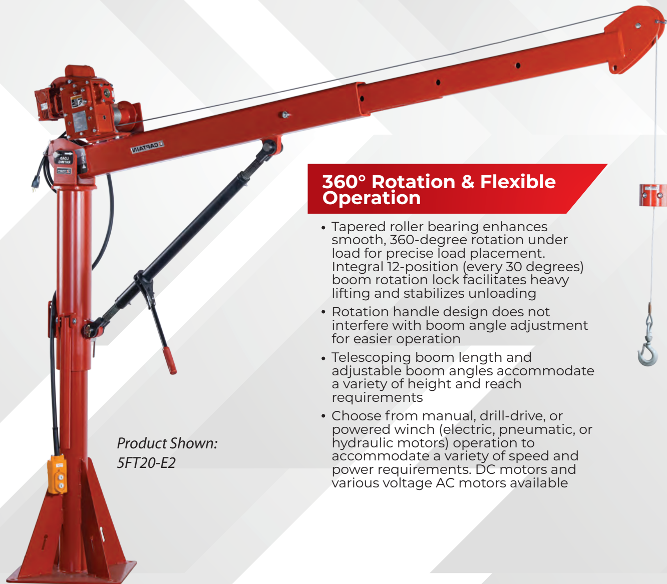
Product Shown: 5FT20-E2

The 5FT20 Captain 2000 stationary davit crane (up to 2,000 pounds) is designed for permanent installation. It features a telescoping boom to reach, lift, and rotate very heavy loads 360 degrees—smoothly and easily. A screw jack comes standard to facilitate boom angle adjustments. For long or heavy lifts, add a Thern power winch for greater speed. Red-enamel finish and stainless-steel hardware resist wear in harsh conditions or environments. It's perfect for water/wastewater, manufacturing, marine, construction, and oil and gas applications.